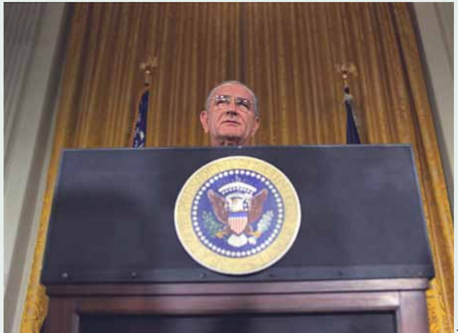
President Lyndon Johnson speaks at the White House ceremony marking his signing of the nuclear Nonproliferation Treaty on July 1, 1968.

— John F. Kennedy, American University, June 10, 1963