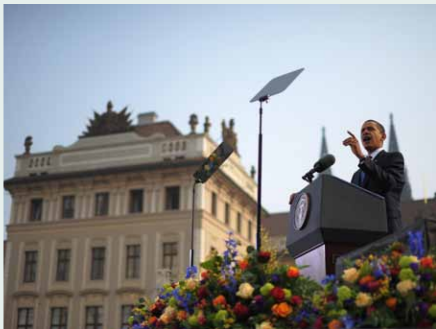
In his speech in Prague on April 5, 2009, President Barack Obama spelled out steps leading to a world free of nuclear weapons.

—Ronald Reagan, State of the Union address, January 25, 1984