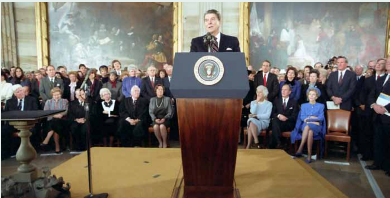
Ronald Reagan Library