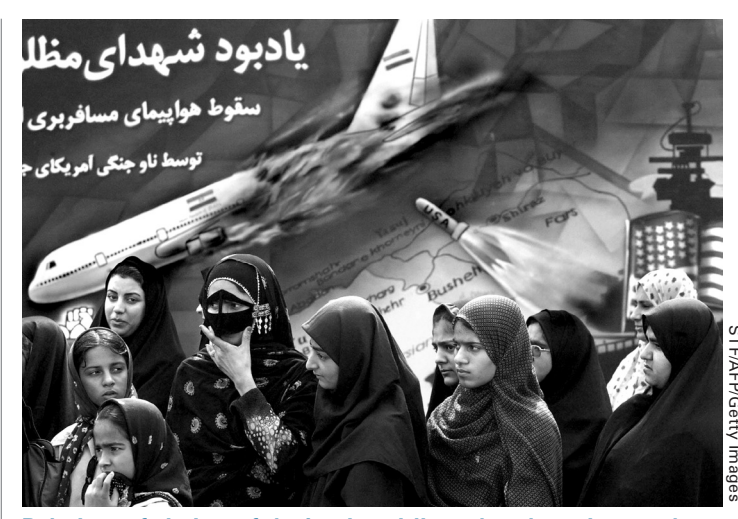
Relatives of victims of the Iranian airliner shot down in error by the U.S. Navy cruiser USS Vincennes over the Persian Gulf in 1988 stand under a painting depicting the scene during a 2003 ceremony in the Iranian port city of Bandar Abbas.

The Iranian public, meanwhile, is subjected to