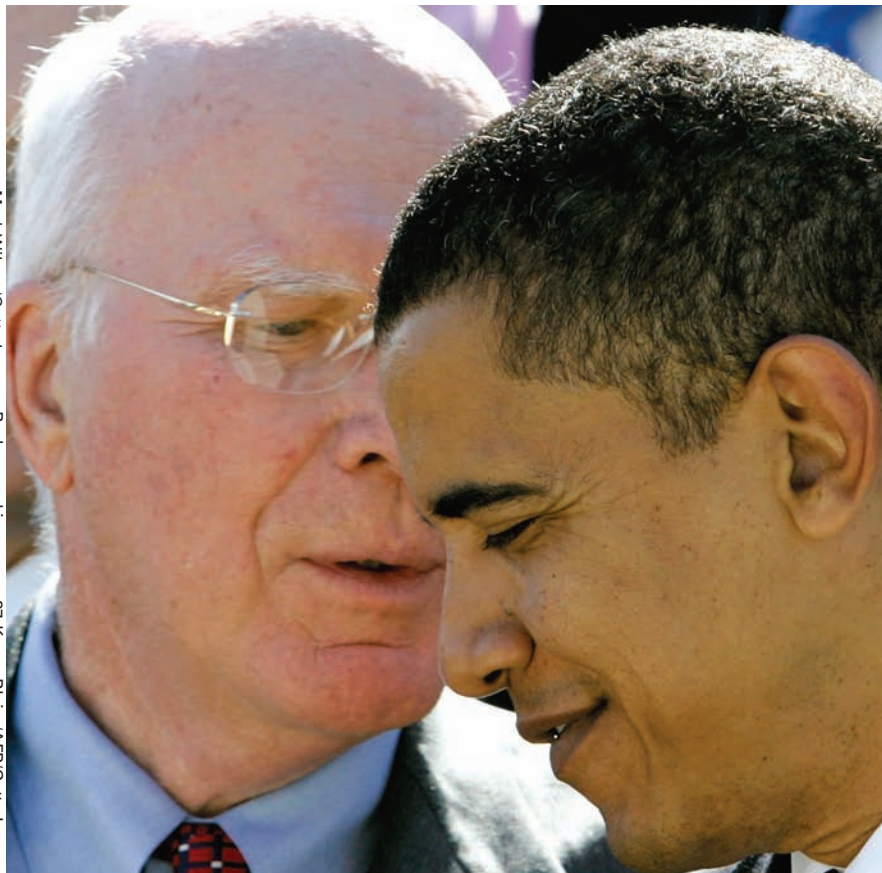
Senators Patrick Leahy (D-Vt.) and Barack Obama chat during a May 2, 2006 media conference on Capitol Hill. Obama co-sponsored legislation introduced by Leahy and Arlen Specter (R-Pa.) prohibiting the future procurement of victim-activated landmines.